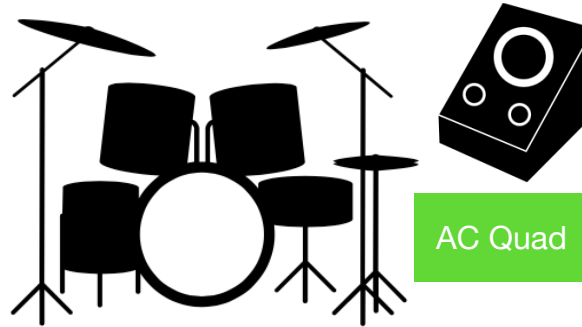
Matthew - Drums Mix 4