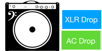
Aguilar 4/10 w/XLR