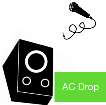
Lee - Guitar/Vox Mix 1